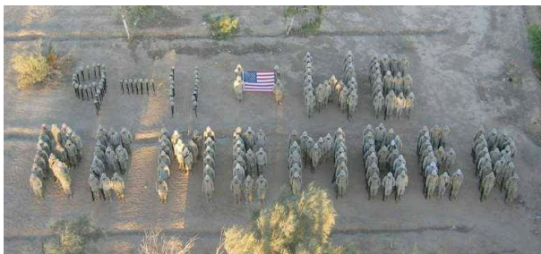
BCoMarines in Iraqi..... "Less we forget"