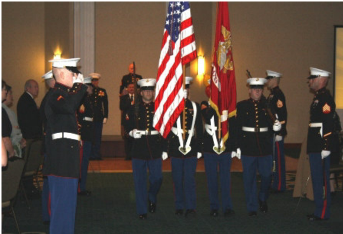
Marine Corps Birthday Ball celebrated at the Grove Hotel by the "C" Company Marines, 4 th Tank Battalion. Semper Fi Brothers.... and thanks for your services.