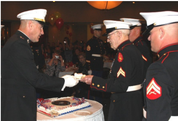
Cake being presented to the oldest Marine as History and Tradition is being followed throughout the Marine Corps