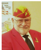
From The SrViceCmdt