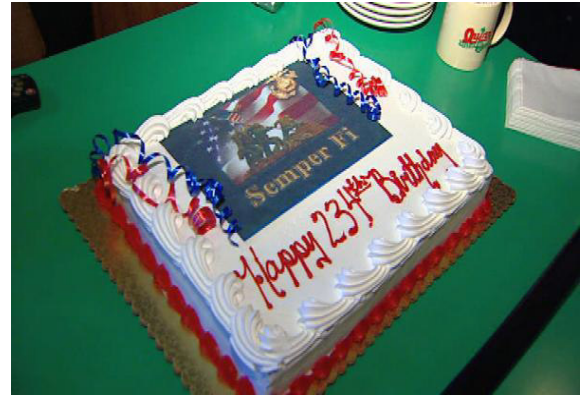
After the cake cutting ceremony at the ISVH, it was off to Quinn's restaurant for another ceremony and cake cutting